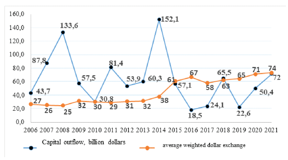
Fig. 1. Dynamics of the net capital outflow from the Russian Federation and the dollar exchange rate.

To assess the impact of the system of currency regulation on economic security, it is worth mentioning such a threat as illegal movement of capital abroad [9]. A number of authors also consider issues related to the hidden movement of capital between countries [10]. Consider the indicator of net (legal) capital outflow presented in the structure of the balance of payments of the Russian Federation.