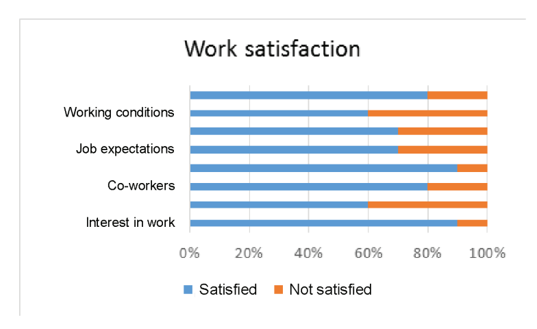
Fig. 1. Employee's work satisfaction level.

The study showed a generally high degree of HC satisfaction, although the criteria "working conditions" and "achievements in the work" are estimated at only 60%.